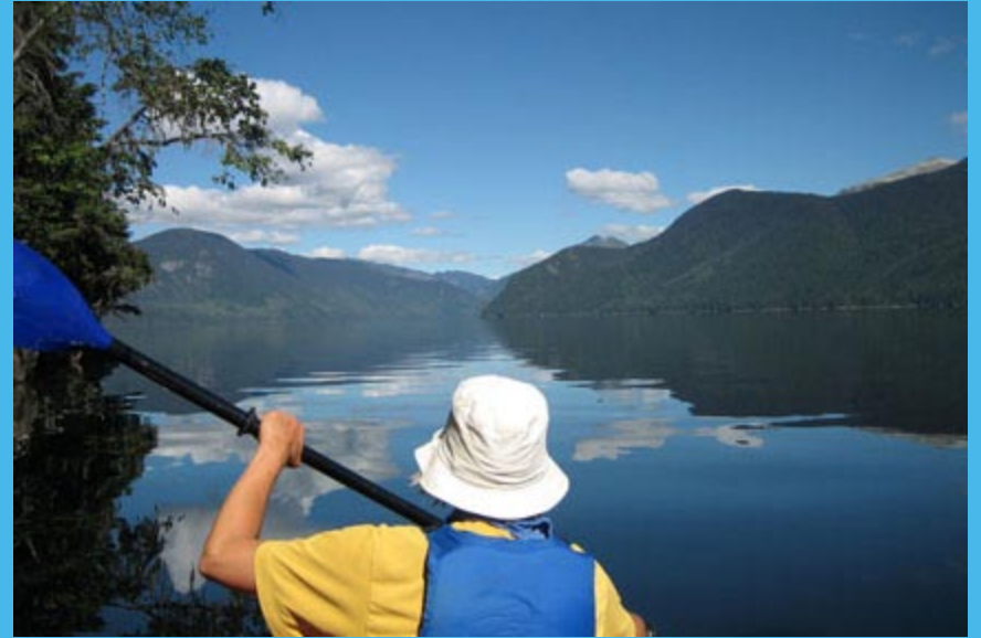
Paddling into the North Arm on a calm day