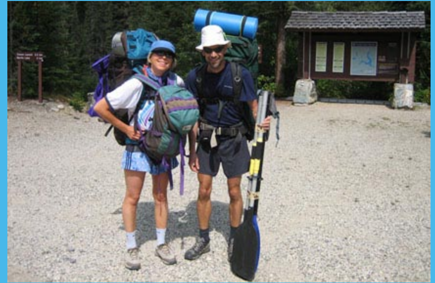
At Murtle Lake trailhead with seven days' worth of food and camping gear - including the boat!