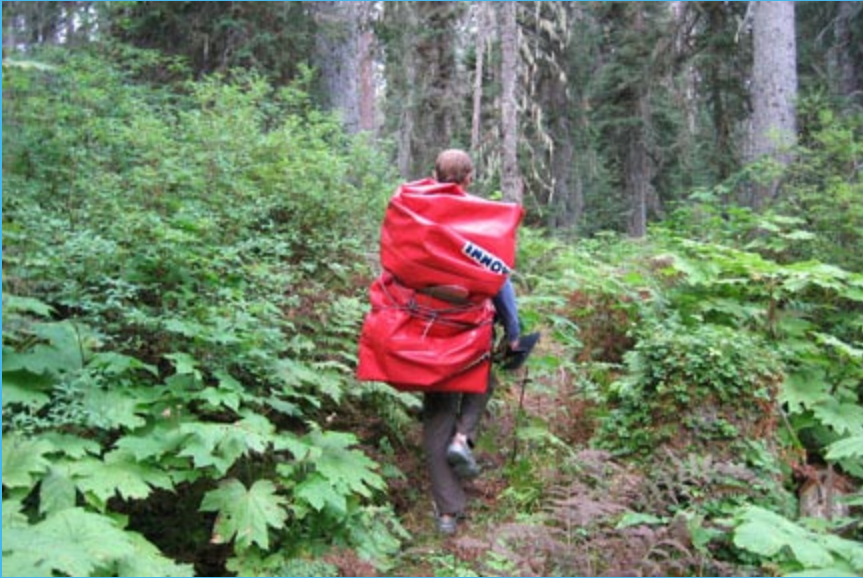
Portaging into File Creek