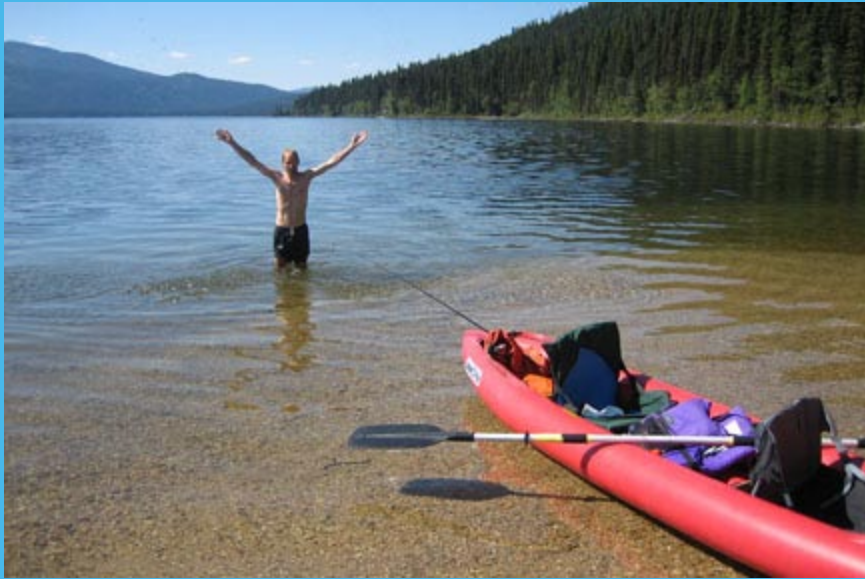
Golden sand on our beach at Cottonwood campsite