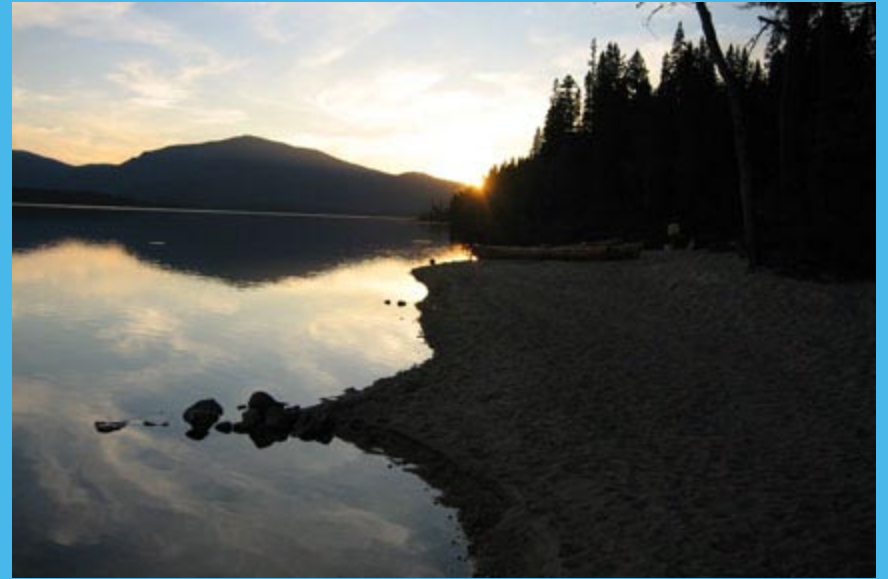
Evening at Cottonwood campsite. The canoe belongs to our neighbours