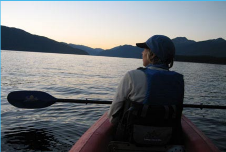
Early morning on Murtle Lake