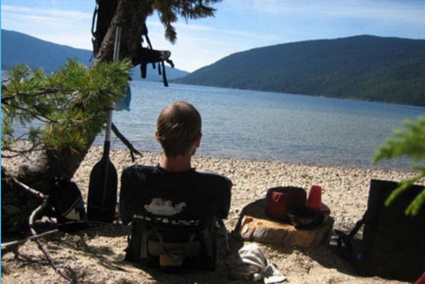
View from the camp at Strait Creek