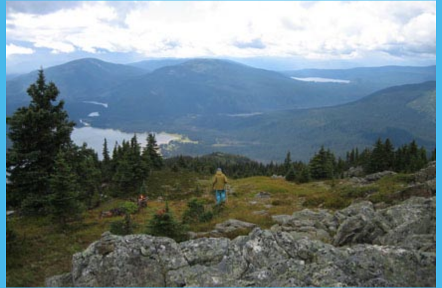
Descending Central Mountain, West Arm of Murtle Lake below