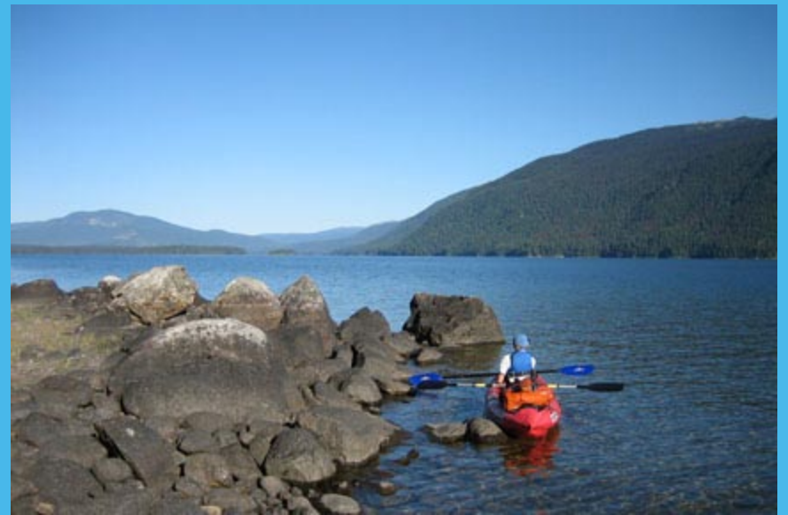
West Arm of Murtle Lake