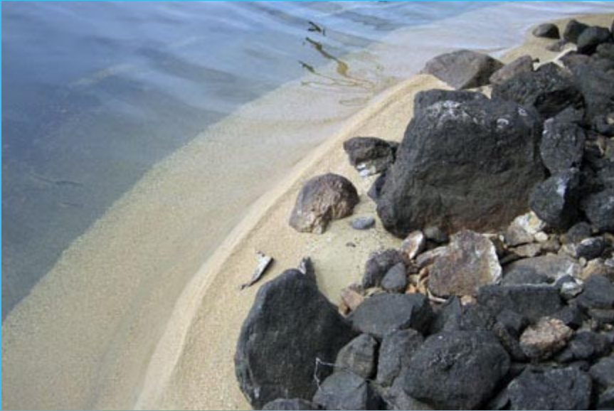
Zen-like rock and sand patterns near Cottonwood campsite