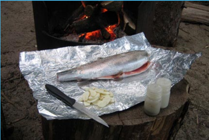
Gourmet Murtle Lake Rainbow Trout