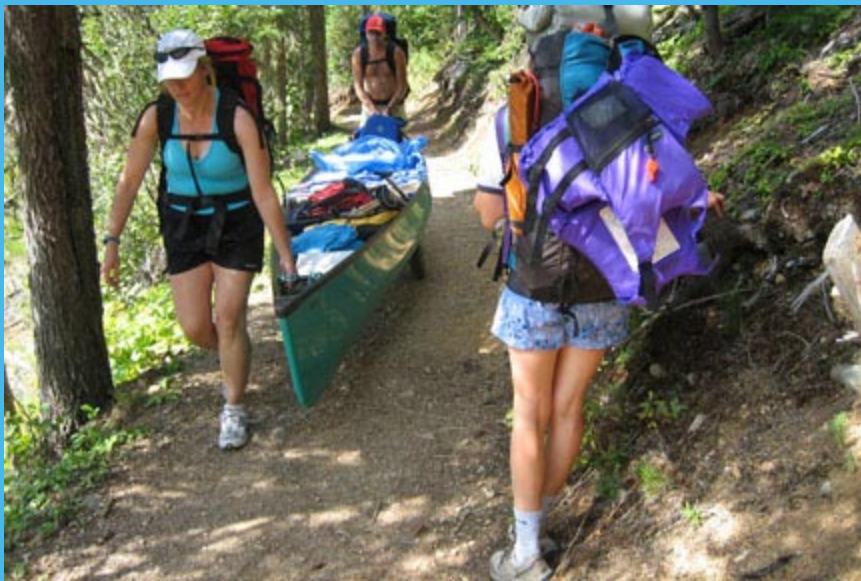
Making room for serious campers on the portage trail