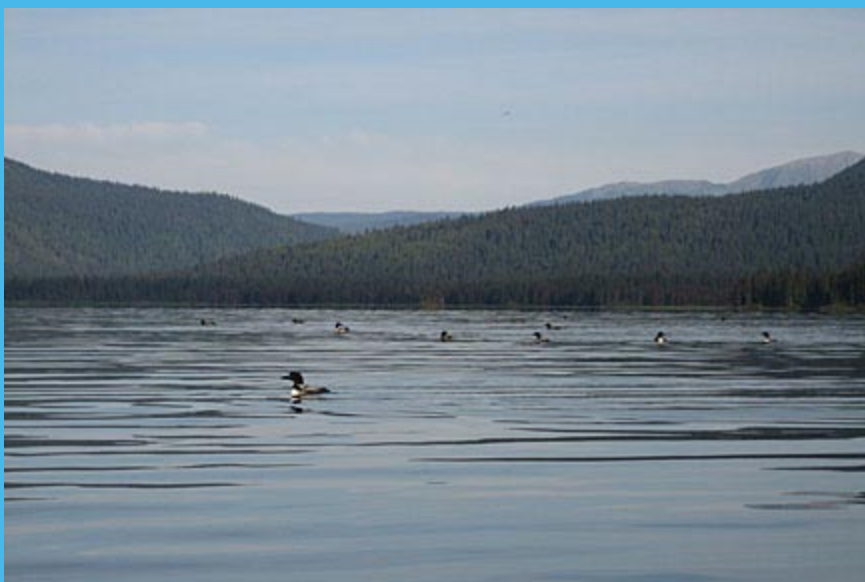
Loon gathering: a frequent event in the morning