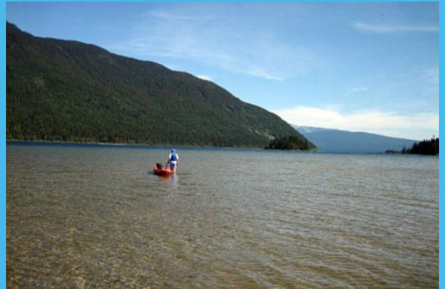
Shallow warm water, golden sand near Tropicana (West Arm), Leo Island in the centre