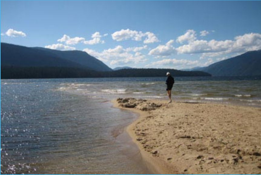
Whitecaps on the lake: a good excuse to stay overnight at Murtle Lagoon campsite