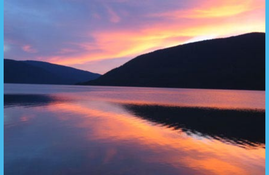
Sunset at Strait Creek, looking towards the West Arm