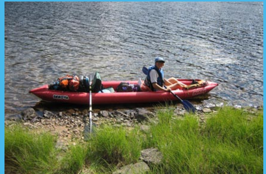
Ready to launch at Murtle Lagoon