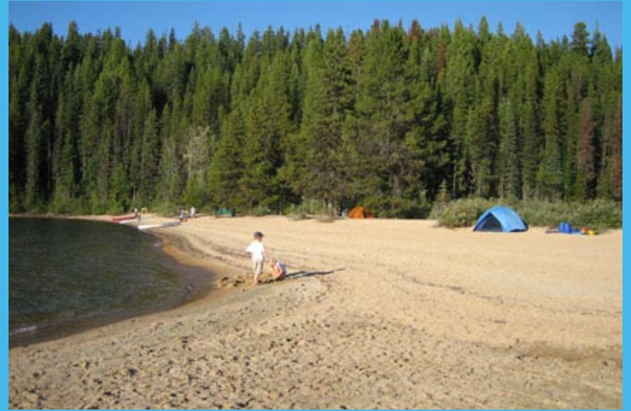
Murtle Lagoon campsite